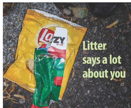
Anti-littering ads by the City of Toronto's LiveGreen.

See where/how to submit your entry at cedarhilltx.com/BESBoard . You must have "#keepcedarhill-beautiful" in your post. Video must be no longer than 20 seconds. You can put music to your video, create a new dance, sing a jingle or whatever helps you encourage everyone to pick up litter and keep Cedar Hill beautiful. The contest is open to individuals or groups. All entries must comply with Facebook terms