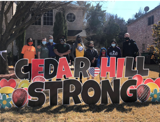
The Cedar Hill Police Department, City staff and City Council Members participated in a Neighborhood Walk in Cedar Crest.